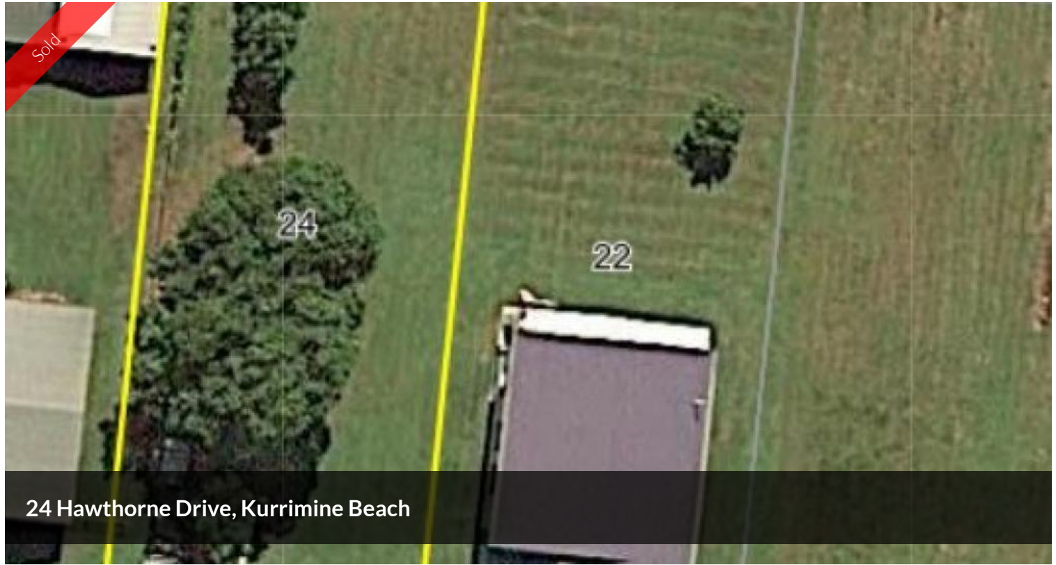
24 Hawthorne Drive, Kurrimine Beach