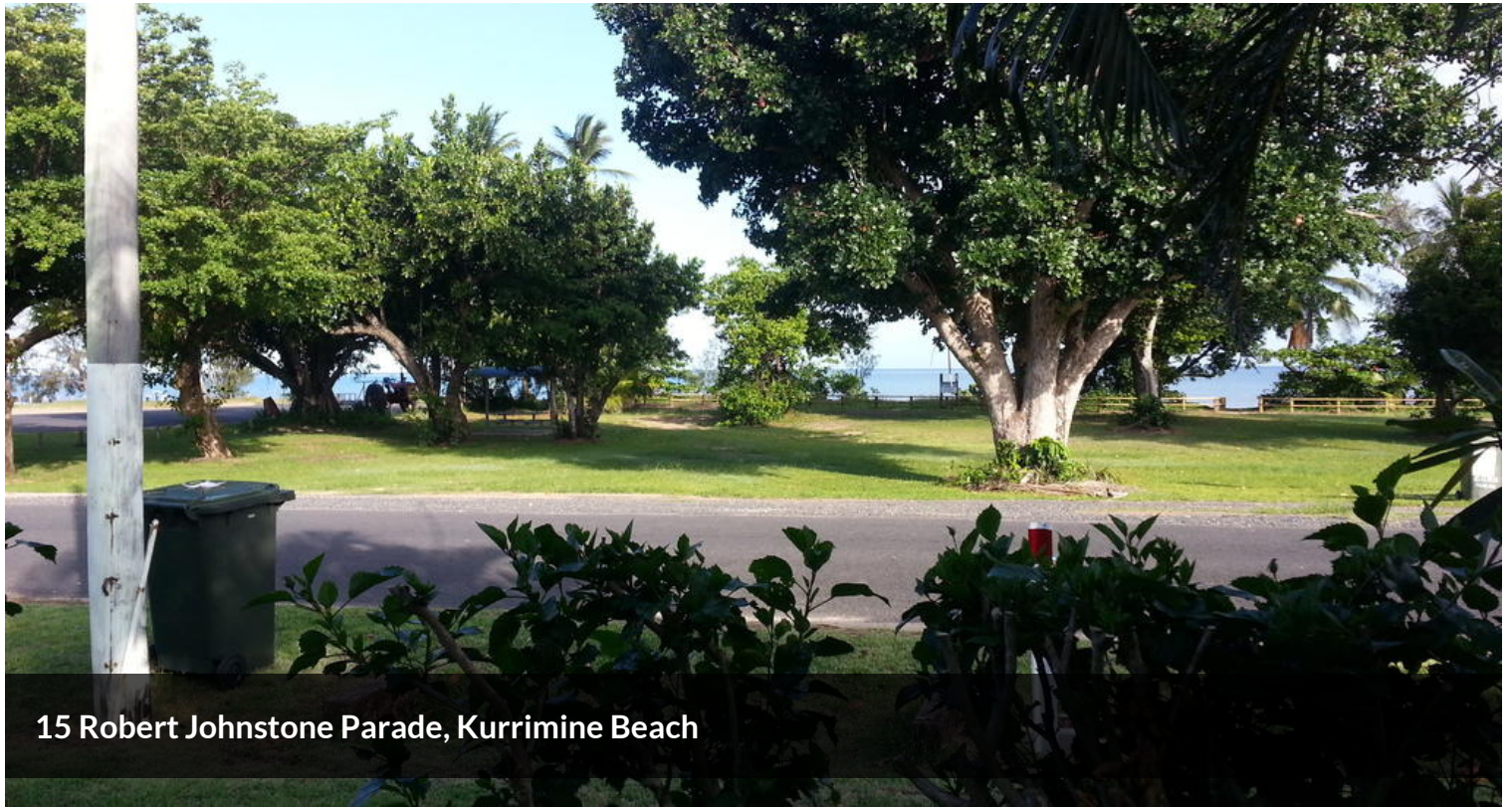
15 Robert Johnstone Parade, Kurrimine Beach