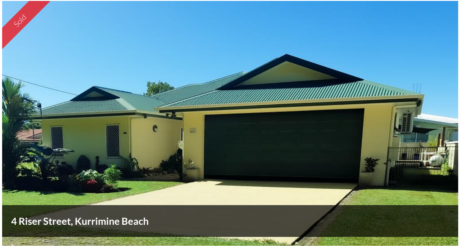
4 Riser Street, Kurrimine Beach