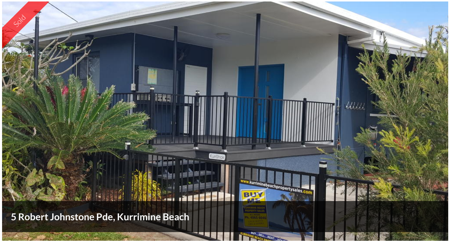
5 Robert Johnstone Pde, Kurrimine Beach