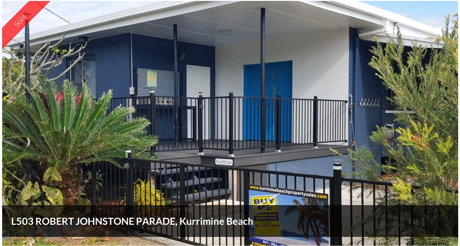
L503 ROBERT JOHNSTONE PARADE, Kurrimine Beach