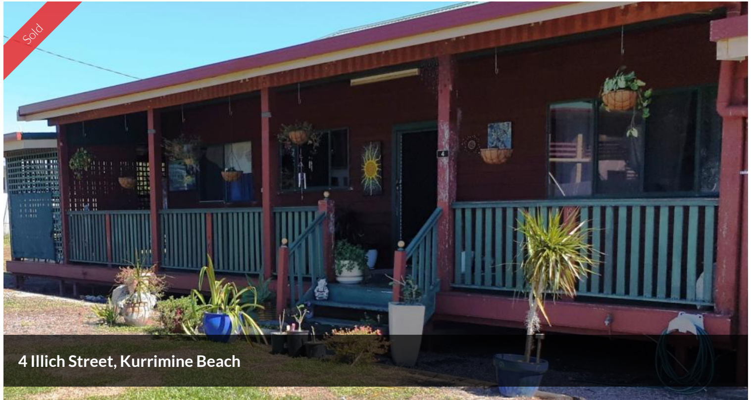
4 Illich Street, Kurrimine Beach