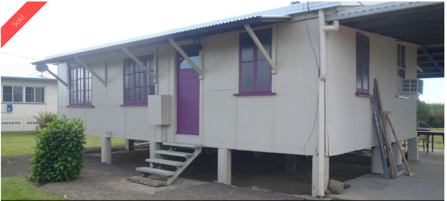
2 Harold Street, Silkwood