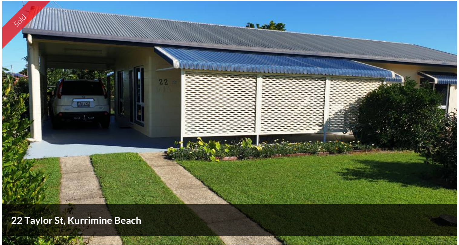
22 Taylor St, Kurrimine Beach